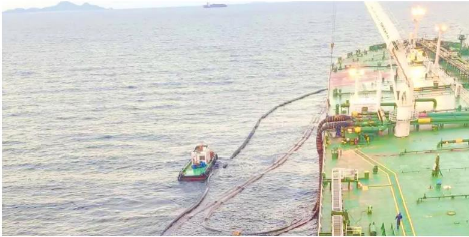
Figure 1: Thai Oil's spill at Chonburi is under control